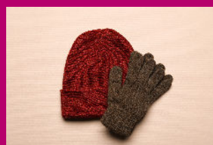
Hat and gloves