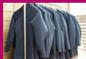
Wetsuit or swimming costume