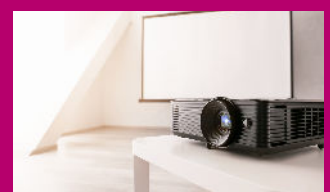
Projector or TV